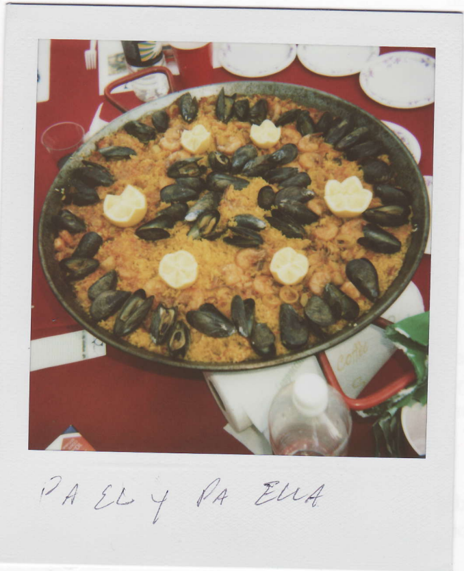
PA EL y PA ELLA