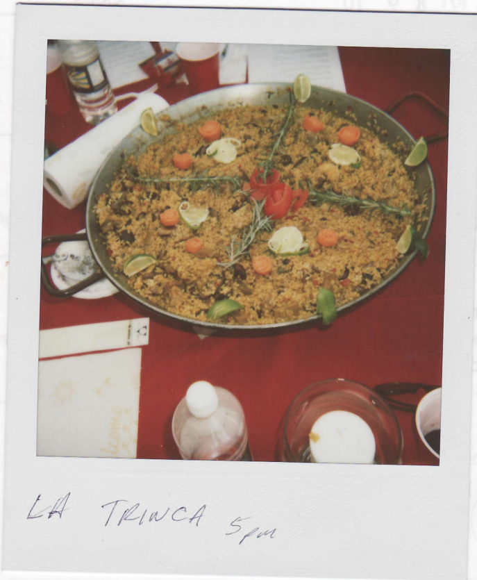
LA TRINCA Spm