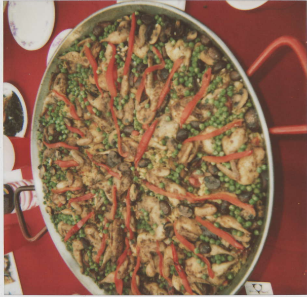
Arroz con Chorrizo