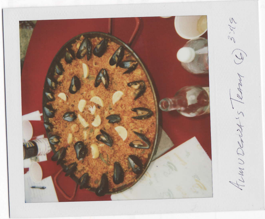
Almurden's Team (C) 2019